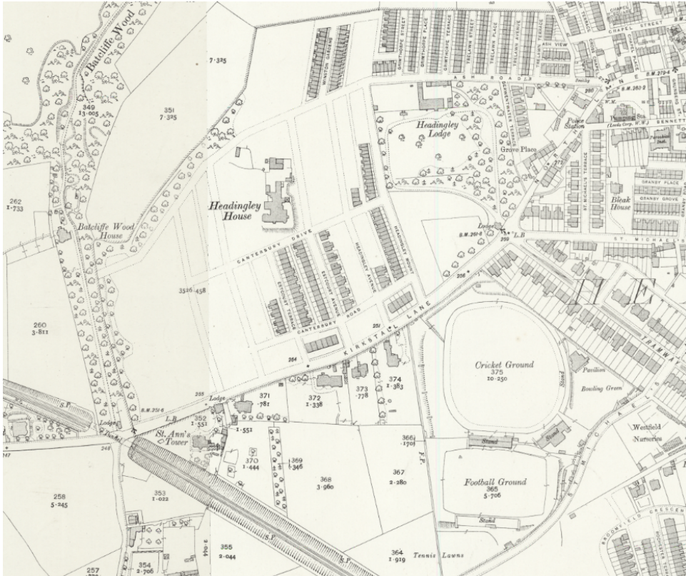
Ordnance Survey 1908