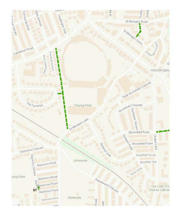
Ordnance Survey 1851